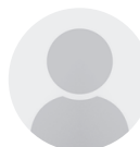
2026 Speakers TBA soon...